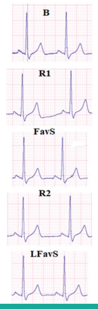
Figure 1. Representative ECGs of girls (n=33)

Music can cause cardio-respiratory modifications. Music is associated with changes in activity in brain structures known to modulate cardiac activity (11). While predominantly