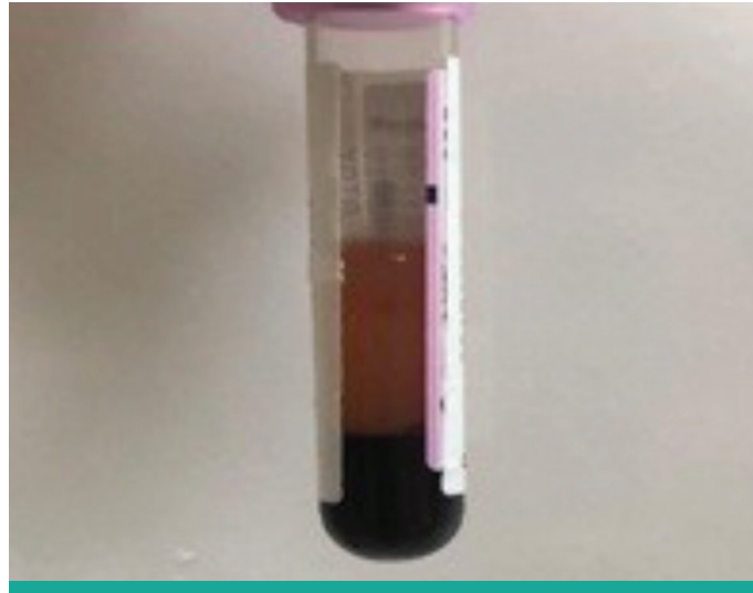
Figure 1. Chylous appearance of serum sample indicating hypertrygliceridemia

biochemical variables and hemogram parameters were all in normal range. No sign of cholelithiasis or dilatation on choledoch was observed. Tomographic examination revealed interstitial pancreatitis and fluid collection around inflammation area, but no pancreatic necrosis or hemorrhage (Figure 2). The patient was diagnosed as drug and hypertriglyceridemia related AP. Antiepileptic medication was switched to levetirasetam which is less likely to cause pancreatic inflammation. Until abdominal pain of the patients recovered, oral nutrition was ceased and intravenous hydration was administered. After an uneventfull hospitalization for 5 days, clinical and biochemical improvements were achieved, and the patient was discharged by recommending out patient clinical follow-up.